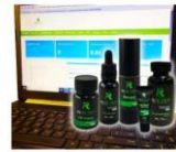
#1 Pick Your Own