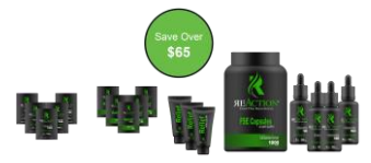
#2 Base Entry Pack $10 SPONSOR BONUS